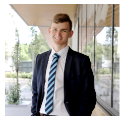
Fin JTS Realty 02 6541 5331