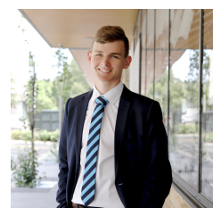
Fin JTS Realty 02 6541 5331